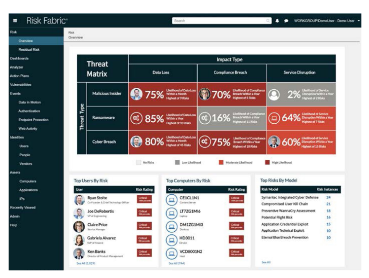
Figure 1: ICA Provides Detailed Visibility into Those DLP Incidents that Command Immediate Response